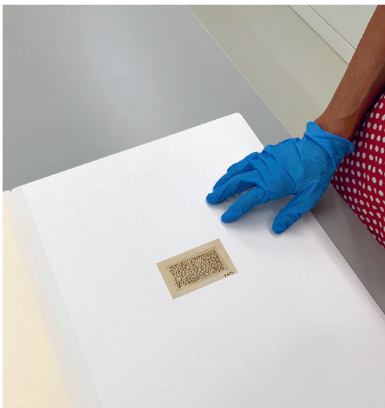
Qur'anic folio, Islamic Art Museum Berlin (76596).