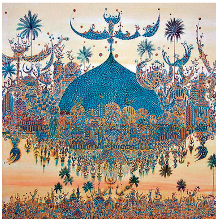
Widad Orfali (b. 1929), Dream City , 1994. Acrylic on canvas.