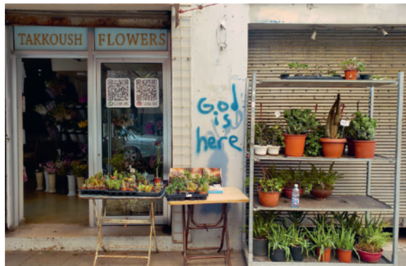
God's presence in the streets of Hamra, Beirut.

"The Qibla of Tolerance': Utopias of coexistence in the UAE" , presentation at the "Utopias in the Middle East" workshop held at the Centre for Islamic and West Asian Studies, Royal Holloway University of London, online / London // 23–24 FEBRUARY / 2–3 JUNE.