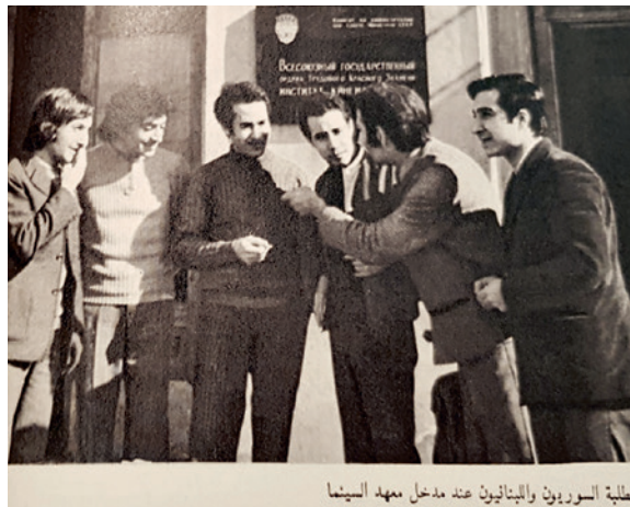
Egyptian Students in the USSR, Mara Sufitiya, 1975, Vol. 6.

Arabische Studierende in der Sowjetunion und der DDR , topic "Arab journalism students at Moscow State University in the USSR, 1960–1980s" // FEBRUARY.