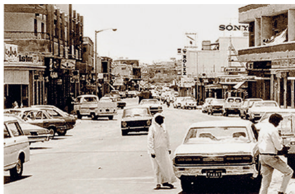
An image of Kahraba street, Doha, c. 1950s, the first street in Qatar with public electricity.