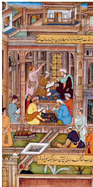
From Naṣīr al-Dīn al-Ṭūsī's masterpiece Akhlāq-i nāṣirī (The Nasirean Ethics). School courtyard with boys reading and writing. Mughal period, circa 1595 CE.

"Religious Discourse as a Methodological Tool in Islamic Practical Philosophy: The Case of Religious Typologies in Philosophical Ethics" , Typologies in the Islamic Ethical Discourse, Orient-Institut Beirut & American University of Beirut, Beirut // MARCH.