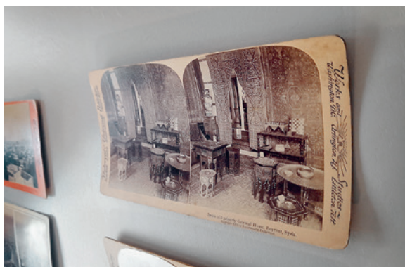
"Salon of a princely Oriental Home, Beyrout, Syria". Photographed by the author at the exhibition "Beirut 1840–1914: Photographs and Maps", Nabu Museum, May 2023.

Imagining Lebanon with Islamic Art: The 1974 Exhibition at the Nicolas Sursock Museum. Regards – Revue Des Arts Du Spectacle, (28), pp.51–87, 2022.