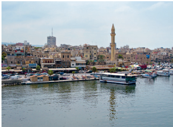
Old Town of Saida.