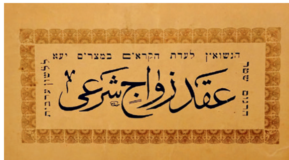
Marriage certificate from Cairo around 1940.

"Eco-Islam: A new path of Islamic thought in the West". In MJAF, 7, 6, Cairo 2022. / "إكو-إسلام: مسار جديد للفكر الإسلامي في الغرب"