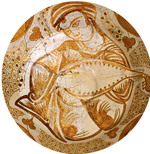
Fatimid Musician Playing Lute, 11th-century plate, Museum of Islamic Art, Cairo.