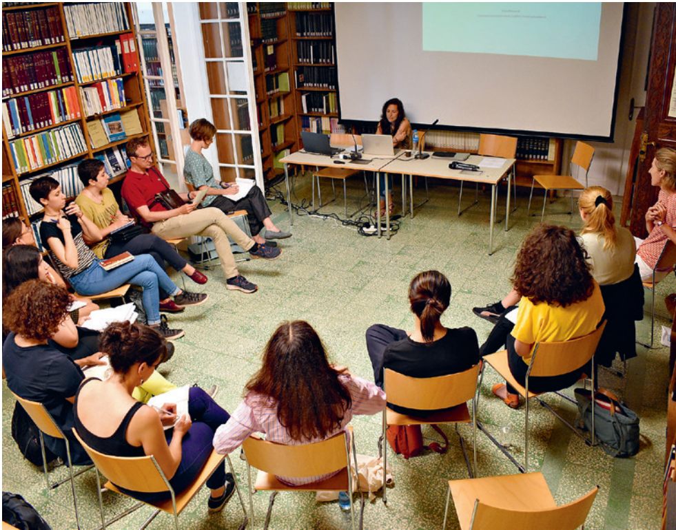
Summer School participants at the OIB.